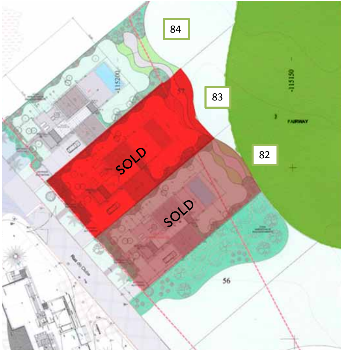
Implantation - villas 82, 83 & 84 close to Clubhouse Quinta da Marinha, Rua do Clube