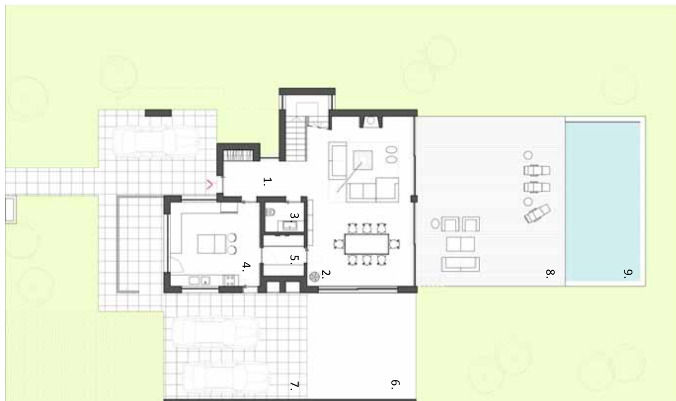
Villas 83 & 84 (T3) - Ground floor plan