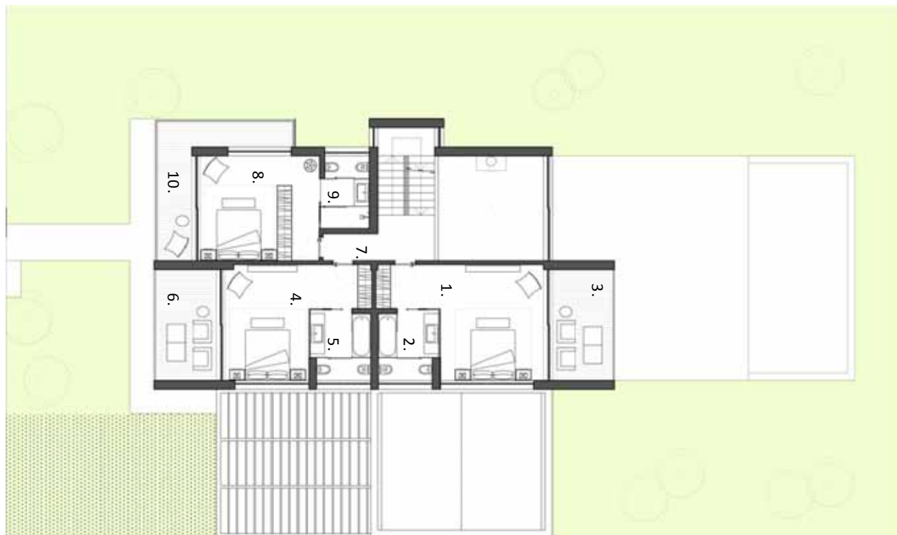
Villas 83 & 84 (T3) - First floor plan